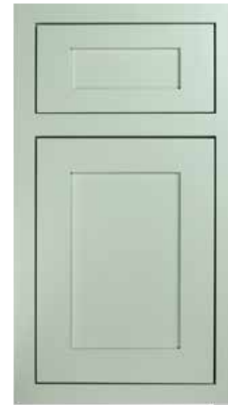
Aubry Construction: Frame Square Inset Specie: Maple & MDF Color: P-Savannah Mist Sheen: 20