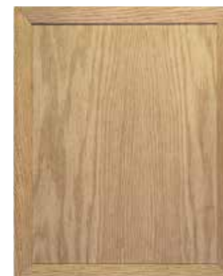
Naples Specie: Red Oak Color: R-OAK-Natural Sheen: 0