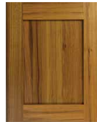
Aubry Specie: Teak Color: Natural Sheen: 10

We recommend ordering a sample for an accurate perception.