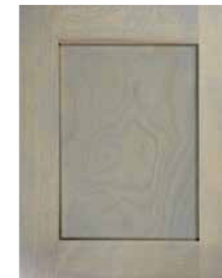
Austin Specie: Maple Color: MAP-4599-Mushroom Sheen: 20