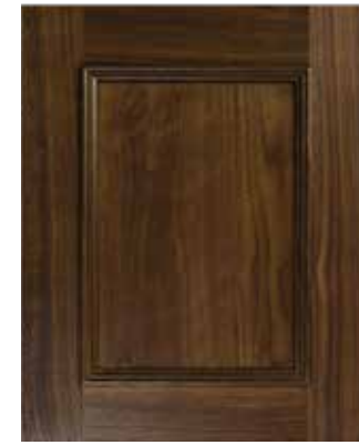
Granby Specie: Black Walnut Color: WAL-Natural Sheen: 20