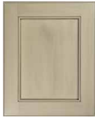
Stoke Specie: Maple & MDF Color: P-5066 Sheen: 20 Glaze: Pewter - Medium Brush