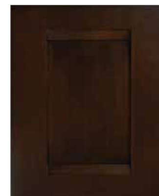
Newport Specie: Maple Color: MAP-5064 Sheen: 20