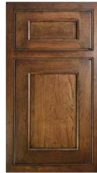
Boston Construction: Beaded Inset Specie: Maple & MDF Color: CHE-5064-Classic Brown Sheen: 10