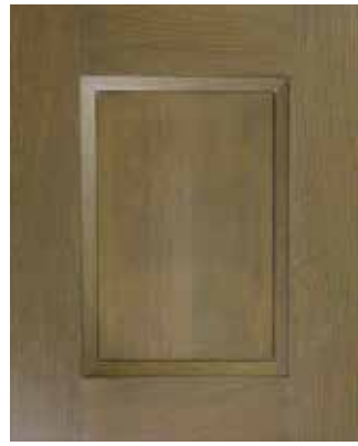
Princeton 3 Specie: White Oak Rift Cut Color: W-OAK-RC-4981 Sheen: 20 Glaze: Brown Egg - No Hang Up