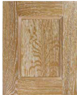
Chandler Specie: White Oak - Quarter Cut Color: W-OAK-QC-Natural Sheen: 20 Glaze: Powder Glaze - White Treatment: Weathered