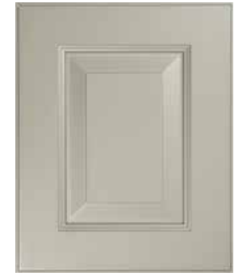
Kirkland Specie: Maple & MDF Color: P-BM-2140-50-Gray Horse Sheen: 20