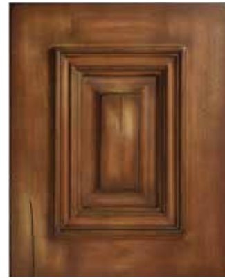
Thetford Specie: Alder Color: ALD-5037 Sheen: 0 Glaze: 5037 Antique Glaze Treatment: Crackle - Distress 1