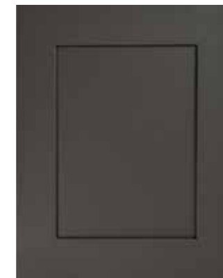
Austin Specie: Maple & MDF Color: P-HC-166-Kendall Sheen: 20