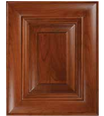
Ogden Specie: Cherry Color: CHE-4578-Cinnamon Sheen: 20