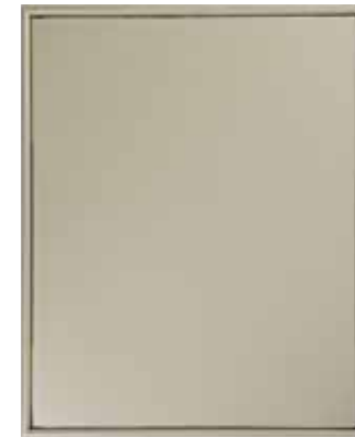
Lake Specie: Maple & MDF Color: P-SW7030 - Anew Gray Sheen: 20 Glaze: Umber