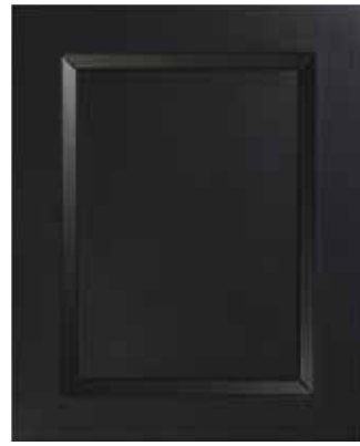
Princeton Specie: Maple & MDF Color: P-4874-Iron Sheen: 20 Glaze: Black - Light Brush - No Hang Up