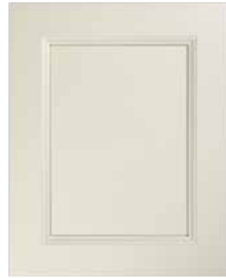
Georgeville Specie: Maple & MDF Color: P-OC-19-Seaperl Sheen: 20