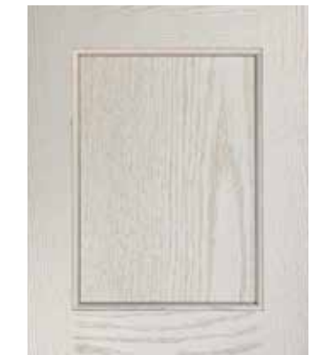
Boston Specie: Red Oak - Flat Cut Color: R-OAK-FC-4912 Sheen: 5