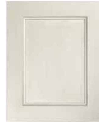
Laursen Specie: Maple & MDF Color: P-PM3-Decorators White Sheen: 20 Glaze: Pewter - Light Brush - No Hang Up