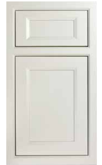
Ulverton Construction: Beveled Inset Specie: Maple & MDF Color: P-OC-130-Cloud White Sheen: 10

North American Cabinets offers endless possibilities so you can find a look that reflects your personal style. We take great pride in creating truly customized contemporary, classic or transitional kitchens that complement your family's lifestyle.