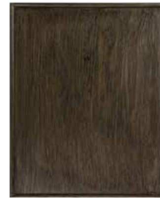
Lake Specie: Red Oak - Flat Cut Color: R-OAK-FC-5063 Sheen: 20 Glaze: 63 - Heavy Brush