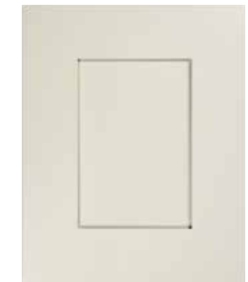
Austin 3 Specie: Maple & MDF Color: P-OC-27-Balboa Mist Sheen: 20