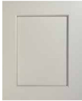
Boston Specie: Maple & MDF Color: P-HC-170-Stonington Gray Sheen: 20