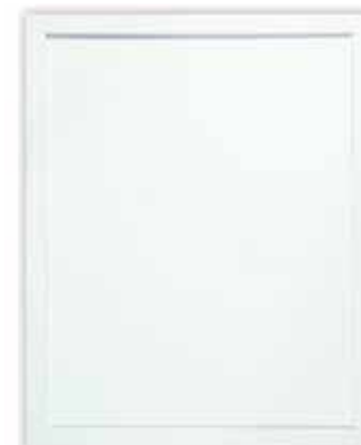
Montreal Specie: White Oak Rift Cut Color: W-OAK-RC 518-1 Sheen: 20