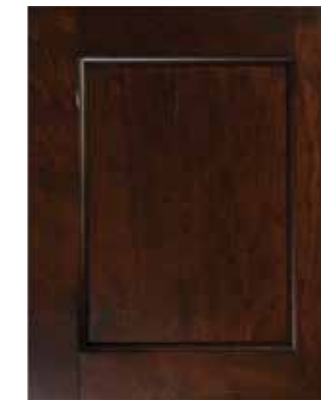
Boston Specie: Cherry Color: CHE-5049 Sheen: 20 Glaze: Black Treatment: Distress 3 - Rub Off