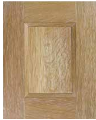
Chandler Specie: White Oak Quartersawn Color: W-OAK-QC-Natural Sheen: 20 Glaze: 4663 - No Hang Up Treatment: Weathered