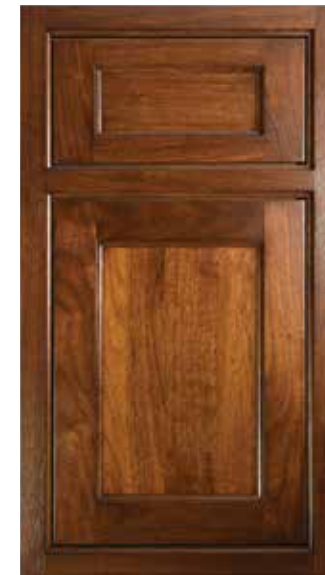
Laursen Construction: Cove Inset 1" Specie: Maple & MDF Color: WAL-4940-Deep Brown Sheen: 10