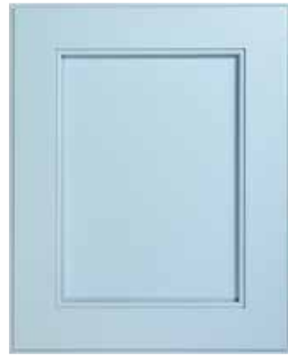
Stoke Specie: Maple & MDF Color: P-2062-60-Blue Hydrangea Sheen: 20