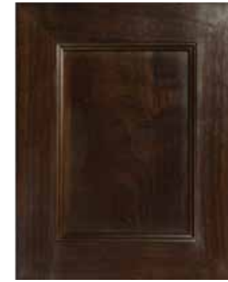
Island Brook Specie: Black Walnut Color: WAL-4875 Sheen: 20 Glaze: Black