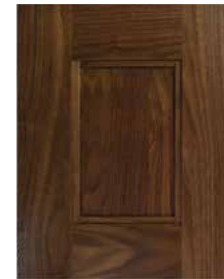
Aylmer 3 3/8 Specie: Black Walnut Color: WAL-Natural Sheen: 20