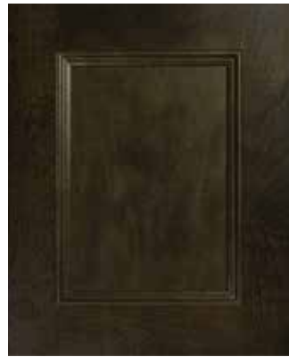
Elite Specie: Maple Color: MAP-5097 Sheen: 20