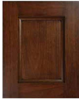
Brossard 1" Thick Specie: Black Walnut Color: WAL-4978 Sheen: 20