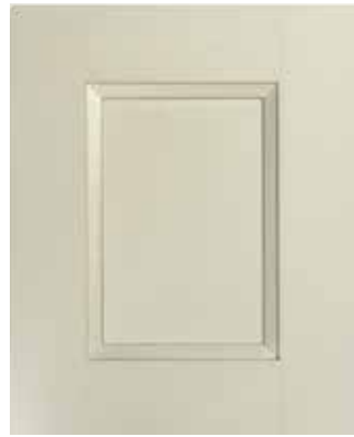
Princeton 3 Specie: Maple & MDF Color: P-217-1-Vanilla Sheen: 20 Glaze: Pewter - Light Brush - No Hang Up