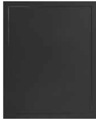
Fraser Specie: 1 PCS MDF Color: P-BM-1603-Graphite Sheen: High Gloss Polyurethane Treatment: No Polish