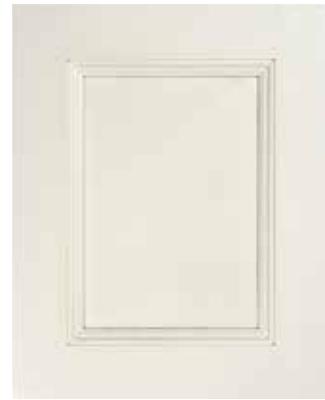
Elite Specie: Maple & MDF Color: P-PM3 - Decorators White Sheen: 20 Glaze: Pewter - Light Brush - No Hang Up