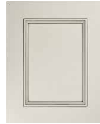
Granby Specie: Maple & MDF Color: PM3-Decorators white Sheen: 20 Glaze: Pewter