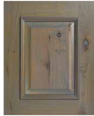
Calder Specie: Rustic Cherry Color: RUS-CHE-4599 - Mushroom Sheen: 20