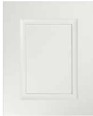
Dorval Specie: Maple & MDF Color: P-518-1 - White Sheen: 20