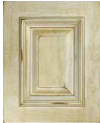
Cambridge Specie: Rustic Cherry Color: RUS-CHE-Washcoat 518-1 Sheen: 20 Glaze: Limestone Treatment: Wrasp Marks - Rub Off