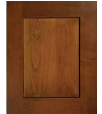
Metro Specie: Alder Color: ALD-5061 Sheen: 20 Glaze: Dark Chocolat