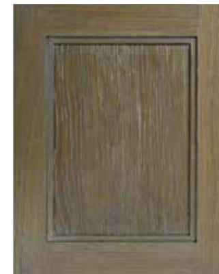
Aylmer Specie: White Oak - Rift Cut Color: W-OAK-RC-5077 Sheen: 20 Glaze: Pewter - No Hang Up Treatment: Weathered