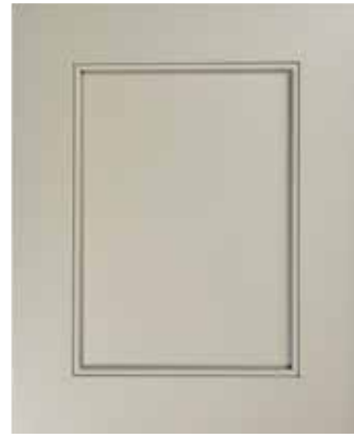
Brompton Specie: 5 pieces MDF Color: P-5062 Sheen: 20