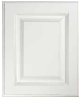
Fermont Specie: Maple & MDF Color: P-1641-Simple White Sheen: 20